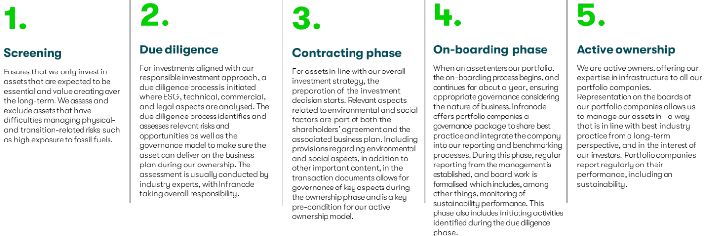
Figure 1: Integration of Sustainability at investment and ownership phases

Principal adverse impacts are the most significant negative impacts of investment decisions on sustainability factors relating to environmental, social and employee matters, respect for human rights, anti-corruption and anti-bribery matters.